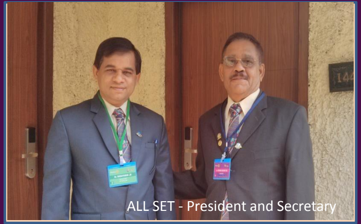
ALL SET - President and Secretary