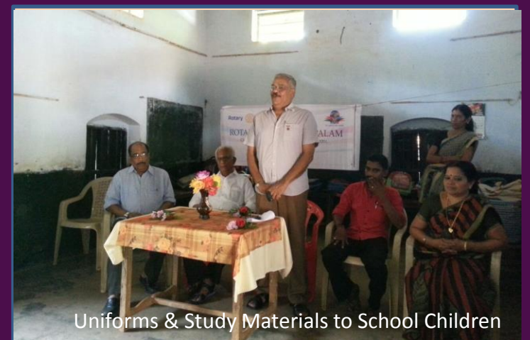
Uniforms & Study Materials to School Children