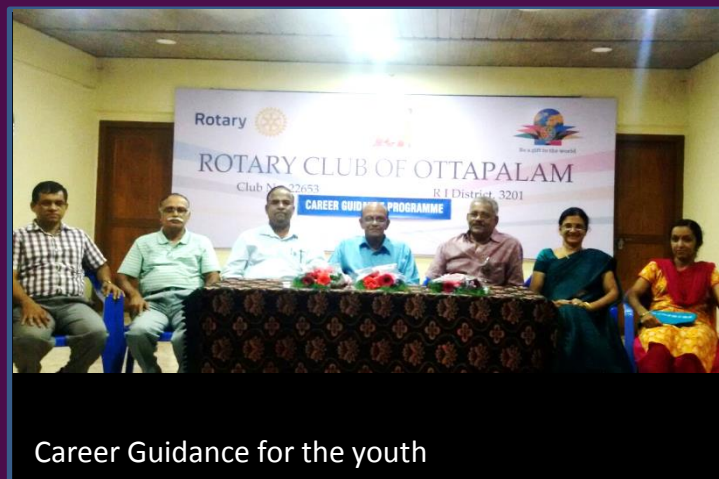
Career Guidance for the youth