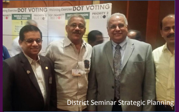
District Seminar Strategic Planning